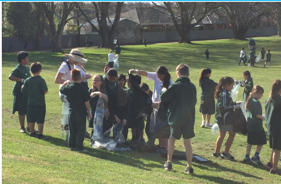
Many helpers ready to fill the rubbish bags.

Last Thursday everyone at Burnside Primary joined in this iconic country wide event. The whole school will be involved in cleaning up our environment. Children worked with their buddy to find and sort rubbish into recycled and non-recycled objects. A great effort by everyone.