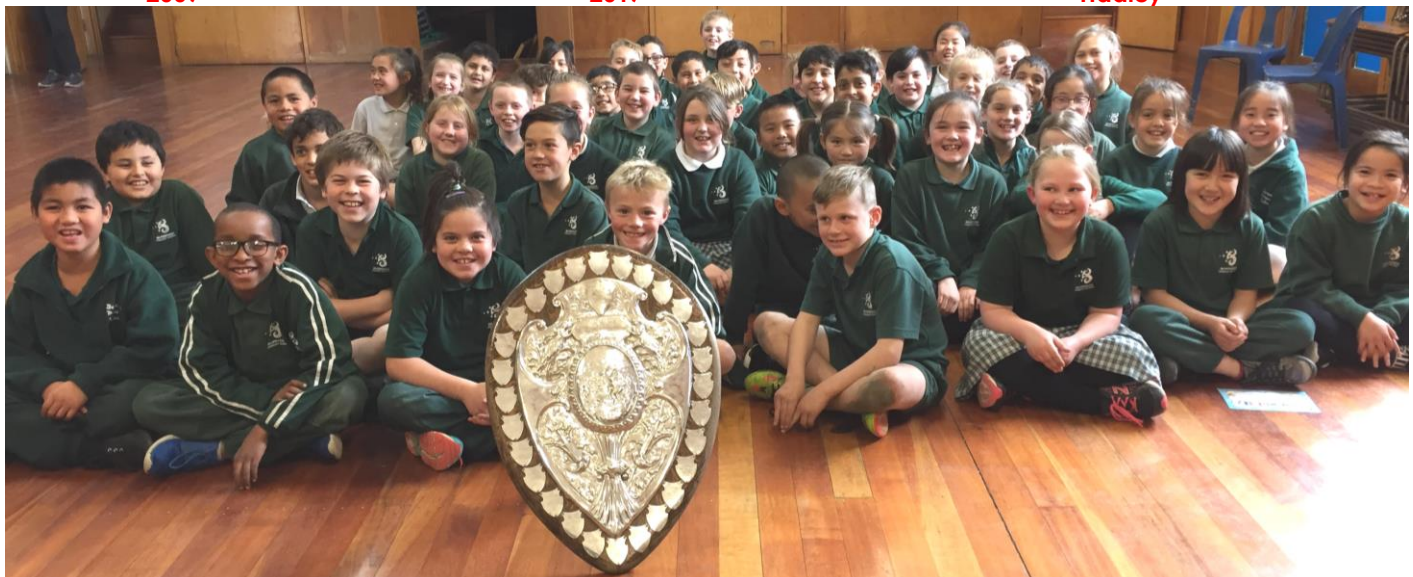
Kahu Rooms 8 & 9