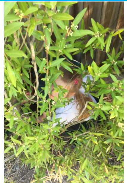
Checking in every space