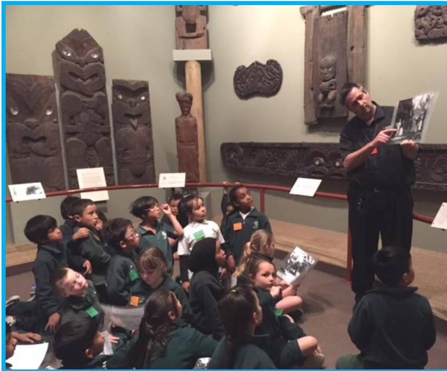
The Tui Team children learning all about games from the past with the Museum educator