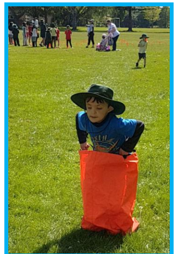
Piwakawaka children taking part in the different sports activities.