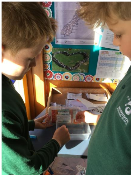
The collection container in Room 12.