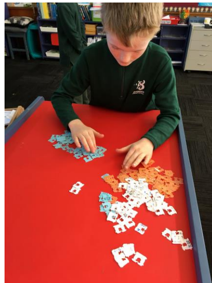
Arthur sorting the tags by colour.