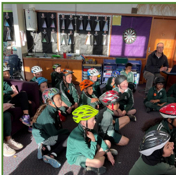
The safety briefing before we start